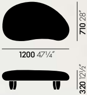
Freeform Sofa Ottoman

Freeform Sofa in Credo, 17 black/aubergine