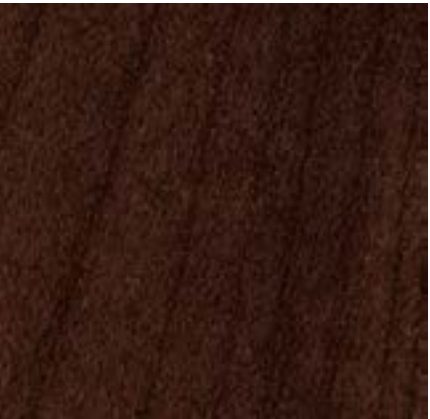
maple, stained walnut-coloured

Wood is characterised by variations in grain, texture and colour, making each wooden furnishing a unique object. Vitra has strict quality standards for the woods selected for its products and uses wood from several trees for the manufacture of a single furniture object made of solid wood. As a result, every piece has a lively and distinctive appearance. The solid woods used by Vitra are mainly sourced in Europe and have an oiled or lacquered finish, depending on their application. Exposure to light will alter the colour of wood over time.