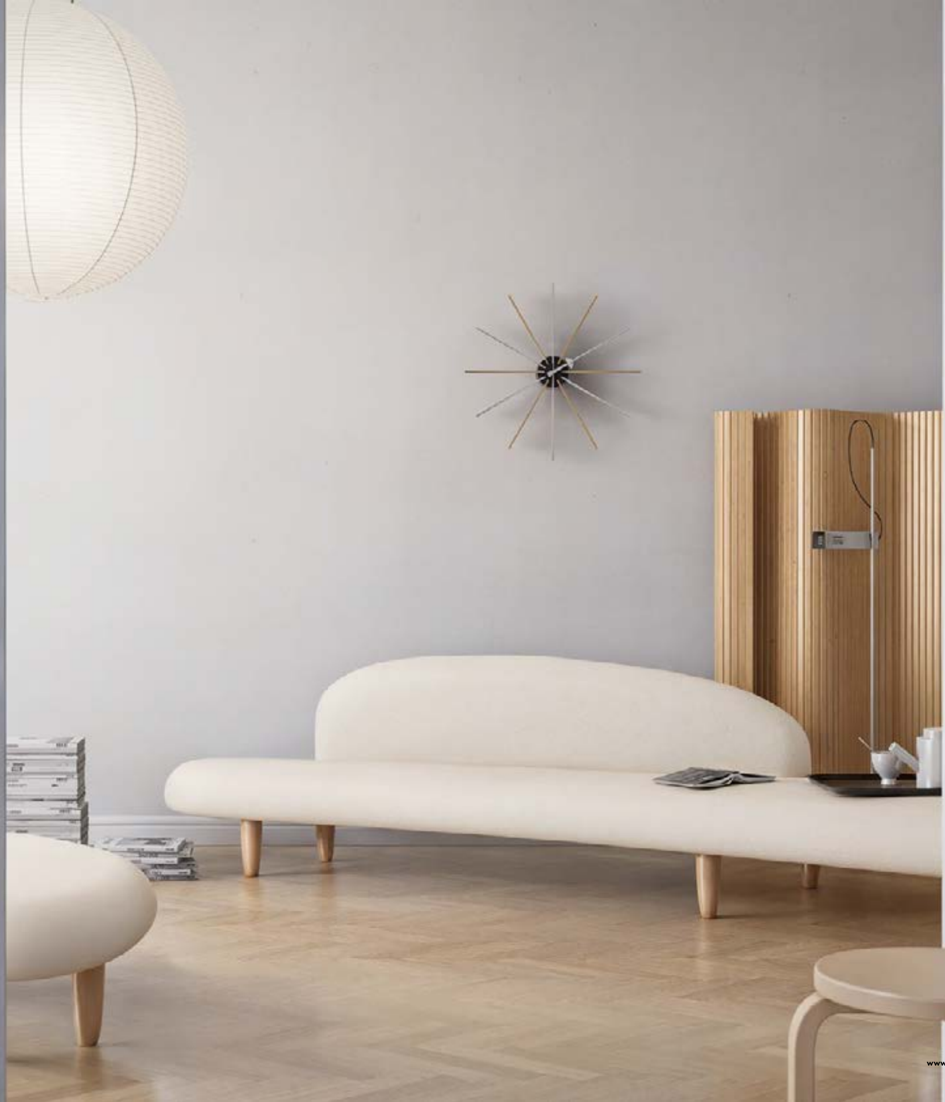
Freeform Sofa in Credo, 01 cream