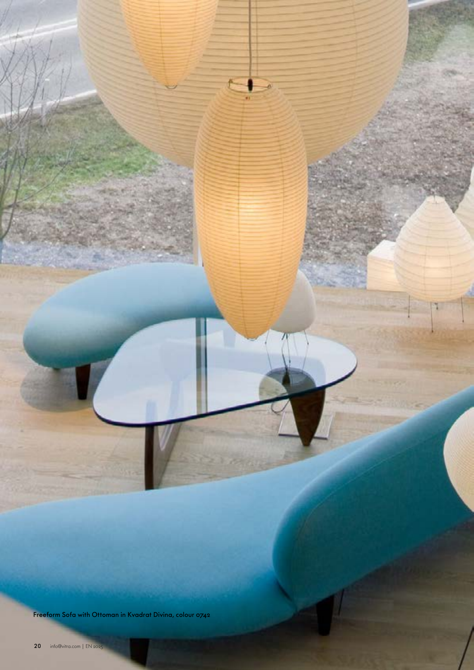
Freeform Sofa with Ottoman in Kvadrat Divina, colour 0742