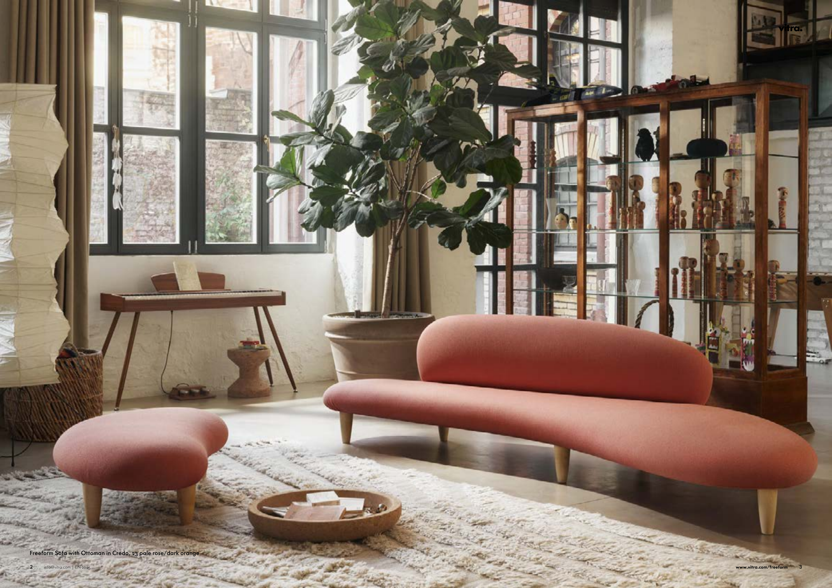
Freeform Sofa with Ottoman in Credo, 23 pale rose/dark orange