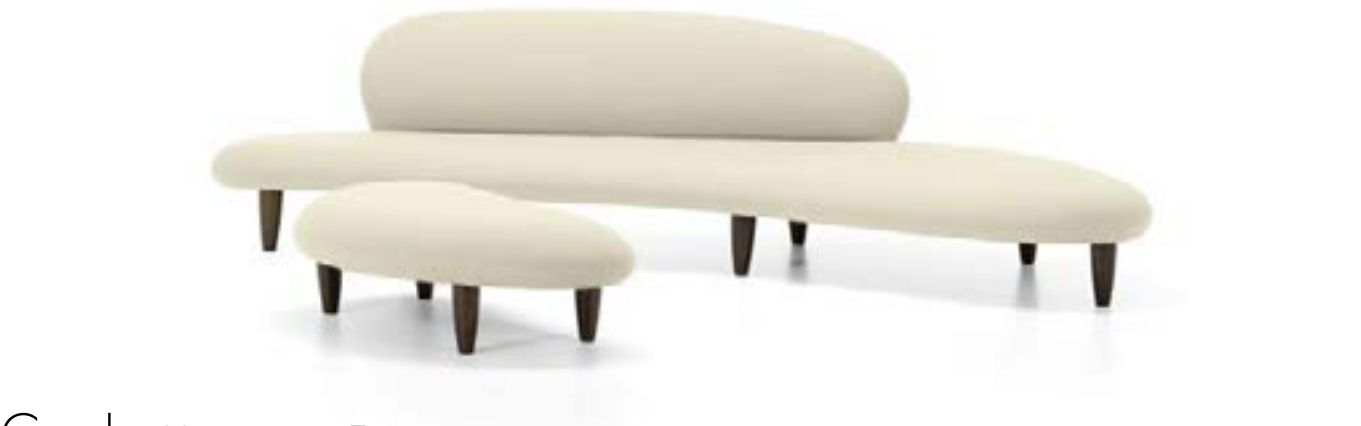
Credo Heavy use, F120