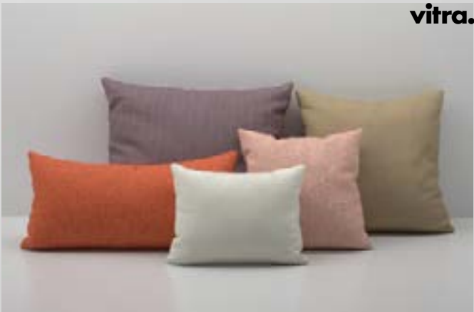
Vitra Cushions, soft comfort Filling made of 100% recycled polyester 65 x 55 cm, 65 x 30 cm, 50 x 50 cm, 40 x 40 cm, 40 x 30 cm