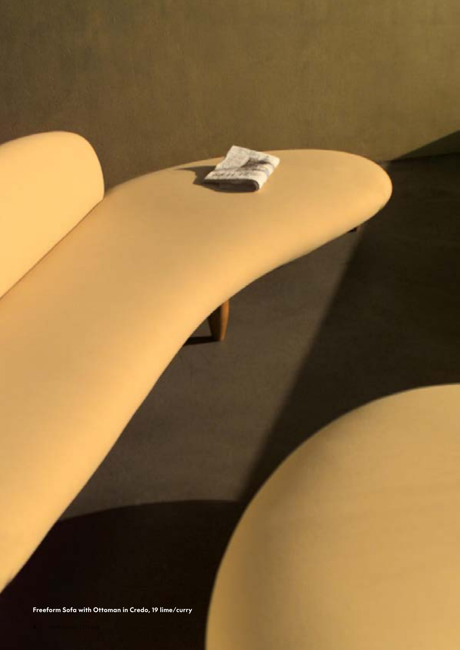
Freeform Sofa with Ottoman in Credo, 19 lime/curry