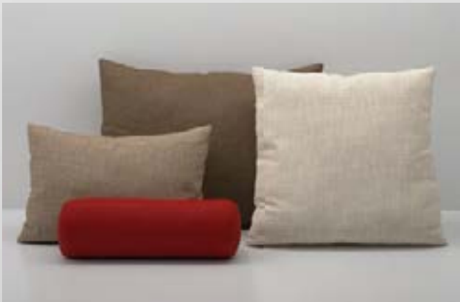
Vitra Cushions, supportive comfort Filling made of 100% recycled PET fibres 80 x 60 cm, 60 x 60 cm, 60 x 40 cm, bolster 54 x ø16 cm

All covers are removable and can be dry-cleaned.