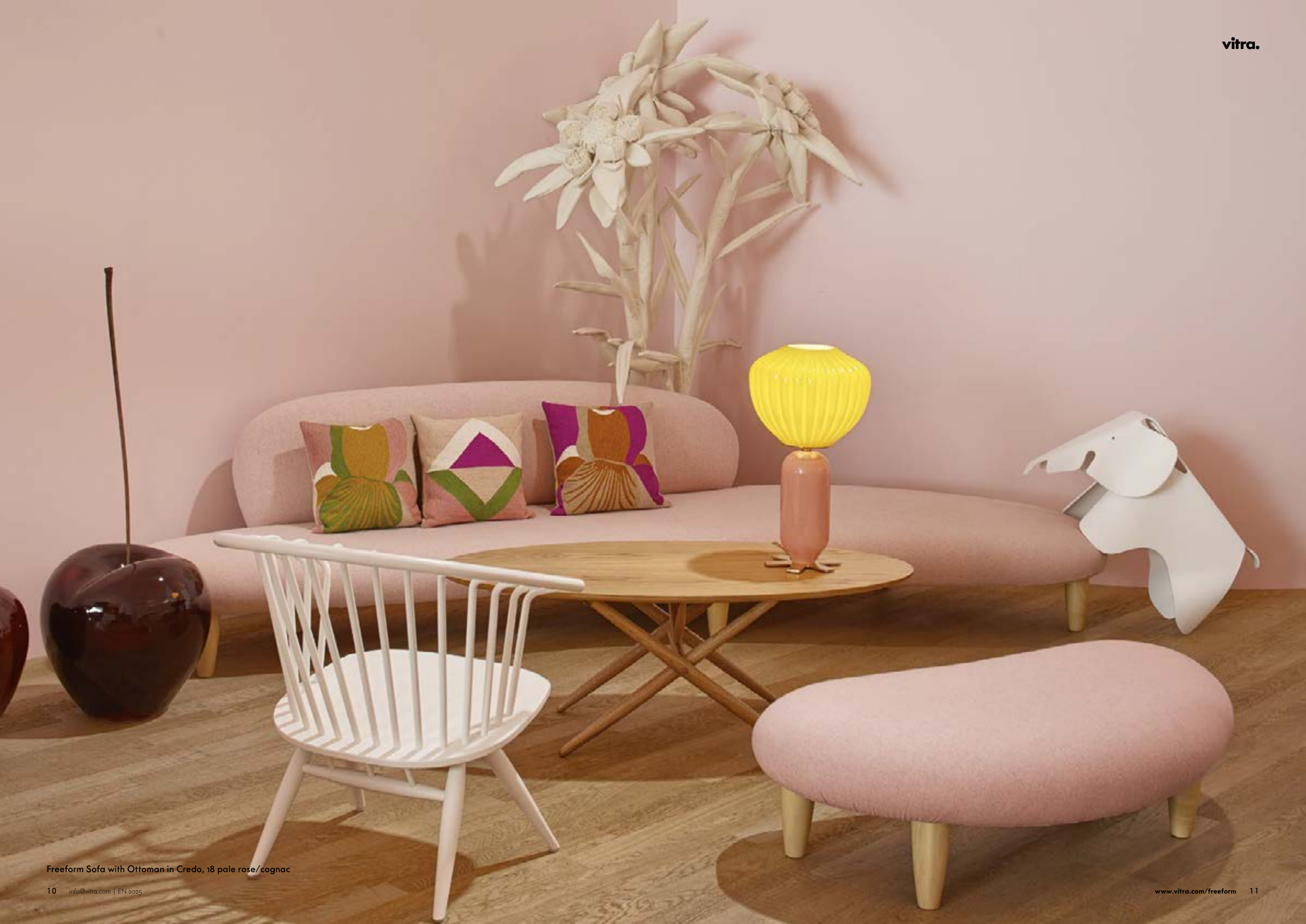
Freeform Sofa with Ottoman in Credo, 18 pale rose/cognac