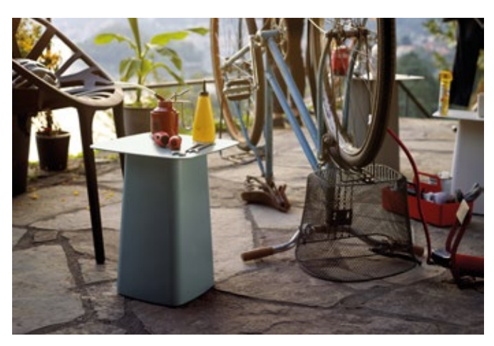
Metal Side Table (Outdoor)

Metal Side Tables are available in a weatherproof, powdercoated version with a fine-textured finish. The tables make a perfect companion for the indoor-outdoor Waver armchair, whose bases come in matching colours.