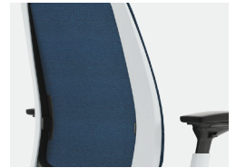
Fabric Back Cover (available on upholstered back styles)